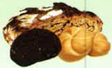
Stale bread / stale bread rolls