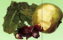
Salad, fruit and vegetable waste