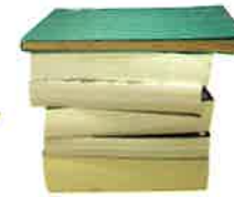
Books without laminated covers