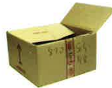
Cardboard packaging (ripped to shreds only)