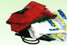
Foil, plastic carrier bags