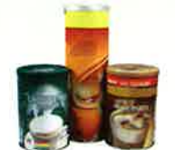
Cappuccino cans, crisps packaging, cardboard or plastic packaging etc.